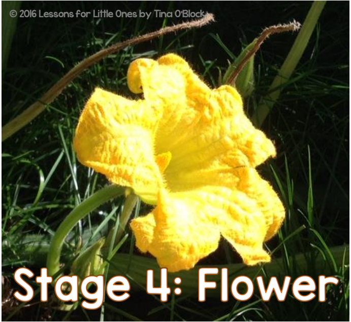
Stage 4: Flower