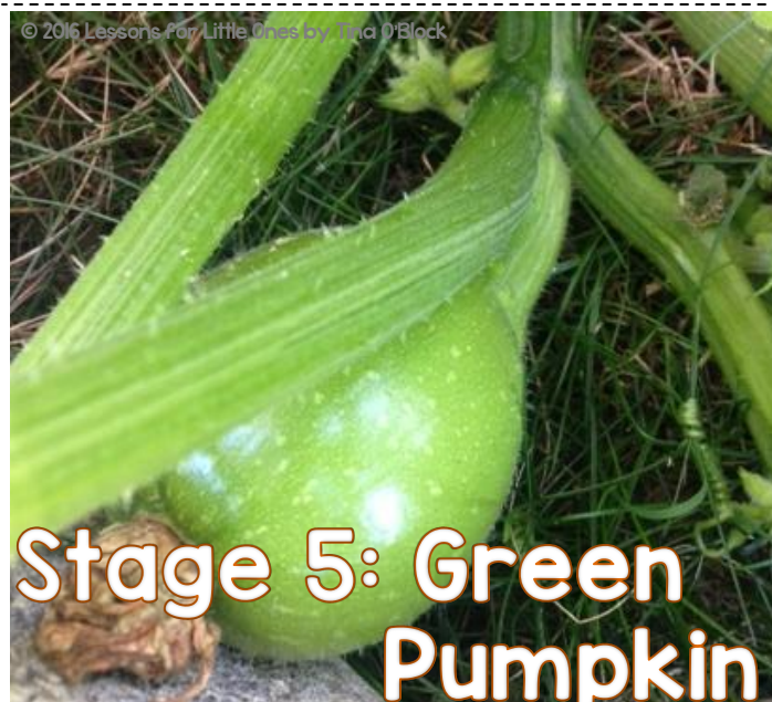
Stage 5: Green Pumpkin