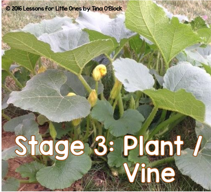
Stage 3: Plant / Vine