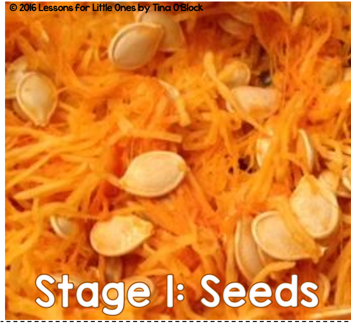
Stage 1: Seeds