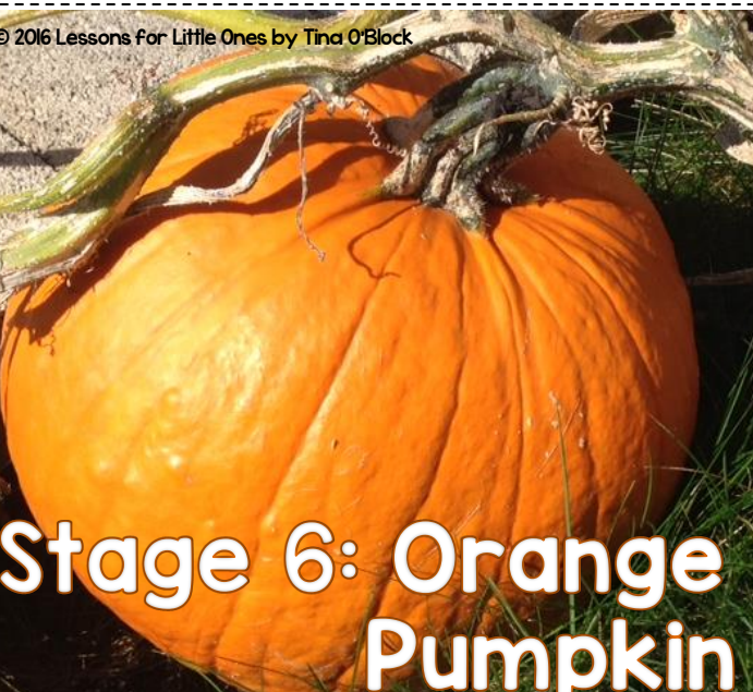
Stage 6: Orange Pumpkin