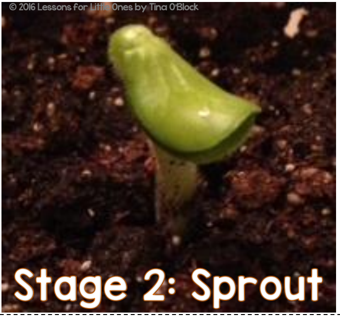
Stage 2: Sprout